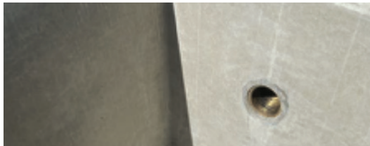
Float Valve Chamber with 2" Inlet