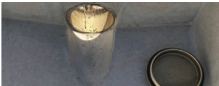
Recessed Drain & Bung